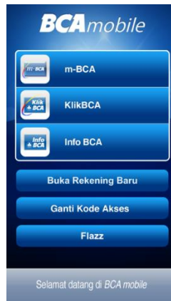
Figure 2. BCA Mobile Home display