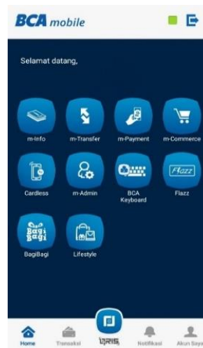
Figure 3. Features on m-BCA

The picture above is a display in m-BCA with various service features as follows: