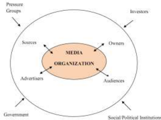
Figure 3 The media environment Sources of Demand and constraint (Denis McQuil, 1992: 82)

In the production of news, media workers are also influenced by external factors, Dennis Mc Quail mention external factors into two categories. The first category to the level of direct influence consisting of news sources, owners, advertisers and audiences. The second category consists of pressure groups, investors, Government, social or political institution. The external influence can be described as follows: