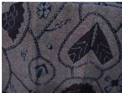
Picture 1 Pamekasan batik with sabet rante motive

The result of the interviews with the respondents shows that nowadays the Madurese people make batik without consideration of their life philosophy. This is different from classical hand-drawn batik. Both in Tanjung Bumi and in Pamekasan we find batiks with philosophical meaning, such as the sabet manik motive, which is also called sabet rante . This motive is specifically made for marriage proposal ritual. This batik is given by the future bridegroom to the future bride. The philosophical meaning of this batik is that the gentleman has bound the lady in the marriage bond. In the Chinese culture prevailing in Indonesia, this philosophical meaning is represented in the gift of necklace from the gentleman to the lady, which symbolizes that the lady is bound by the gentleman in the marriage bond. Both these symbols show the illustrative language which say that the lady is bound by the gentleman who asks for her hand in the proposal ritual. In picture 1 we can see Pamekasan batik with sabet manik motive. Here we find the motive of chain which symbolizes the bond by which a gentleman binds a lady in marriage.