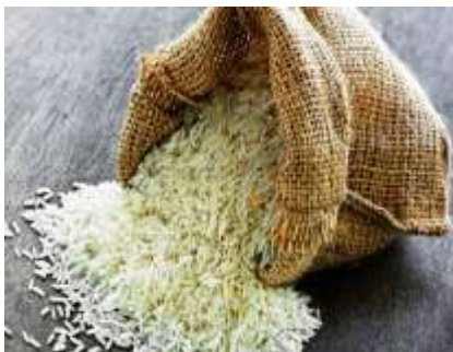
Spilled rice illustration

Concerning the design which forms the background of batik cloth, in Tanjung Bumi batik we find backgrounds with philosophical meanings. Below we can see the photographs of batik with different backgrounds, among others beras tompa (spilled rice) and panji (swastika) backgrounds. In Madurese batik, panji background has the form of the swastika. Beras tompa (spilled rice) background symbolizes prosperity and fertility. Rice is human's basic need, rice is even an important and highly valued commodity because it is considered to be the source of life. People in olden Java and Madura worship the rice goddess which is considered as the producer of rice. The beras tompa (spilled rice) background has the philosophy of hope and prayer that the user of that batik will obtain prosperity and peace. Picture 3 shows the beras tompa (spilled rice) background of Pamekasan batik.