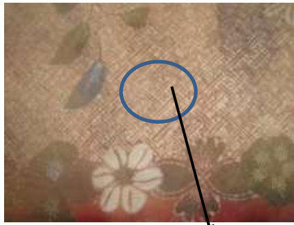
Swastika symbol (卐)