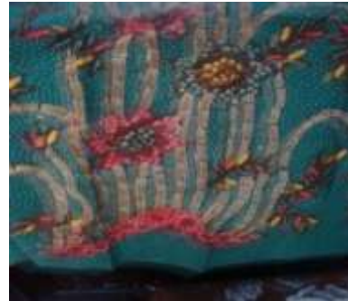
Picture 2 Our documentary photographs of Madurese batik with reng pereng motive which consists of a shrub of bamboo and a pair of chickens.

Concerning the design which forms the background of batik cloth, in Tanjung Bumi batik we find backgrounds with philosophical meanings. Below we can see the photographs of batik with different backgrounds, among others beras tompa (spilled rice) and panji (swastika) backgrounds. In Madurese batik, panji background has the form of the swastika. Beras tompa (spilled rice) background symbolizes prosperity and fertility. Rice is human's basic need, rice is even an important and highly valued commodity because it is considered to be the source of life. People in olden Java and Madura worship the rice goddess which is considered as the producer of rice. The beras tompa (spilled rice) background has the philosophy of hope and prayer that the user of that batik will obtain prosperity and peace. Picture 3 shows the beras tompa (spilled rice) background of Pamekasan batik.