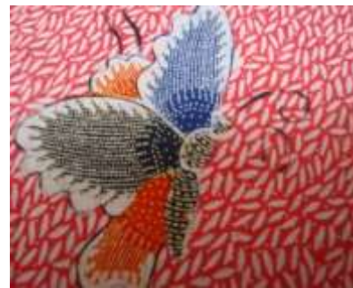
Spilled rice backgrounds motive in batik Pamekasan